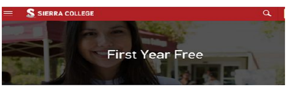
Admissions | First Year Free

Your first year of tuition could be free! We want to remove financial barriers, so all students are able to higher education. There is no income requirement—you just need to be a first-time student (earned 12 fewer college units) and a California resident.